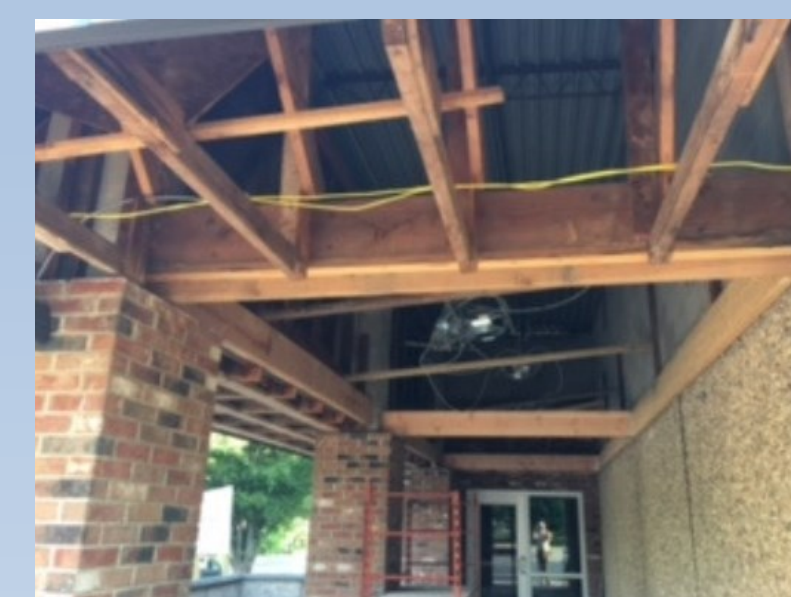
South Windsor EOC