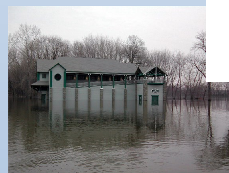
Hartford Boat House